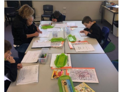
K/6JS children working very hard.